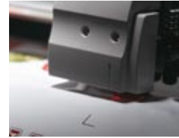
A light pointer easily adjusts the head position to the crop marks.

An optical sensor enables automatic consecutive detection of crop marks throughout the nested images. Together with the automatic adjustment function, it helps to achieve precise contour cutting.