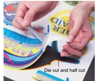
The half cut function is Mimaki's proprietary technology